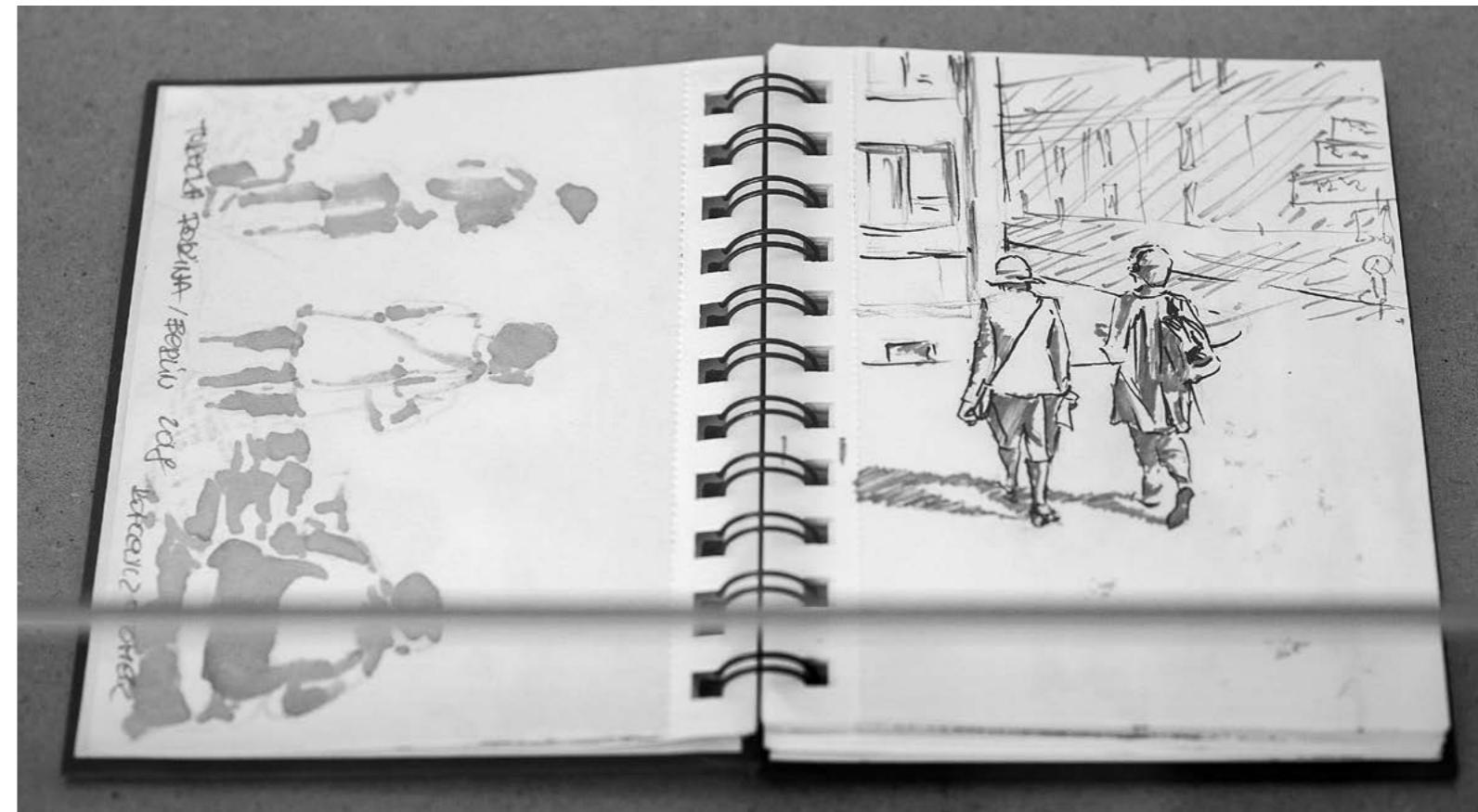
5. "From Berlin to Gdańsk", exhibition detail.

The Polaroid photographs taken by Agnieszka Piasecka [fig. 4] were created with the use of her unique experimental technique, which involves drowning the film in water in order to achieve physical deformation of the photographs, as well as distorting the colours and shapes of portrayed architecture, giving the impression of the unreality of the images, as if they were hung in between the past and the present. At first glance, it is quite impossible to date the photographs. The layer of the image peels of the photographic paper, endowing the portrayed historical architecture with a prevailing sense of transience. The imperative to attribute it to particular time and space does not apply here, as the tangibility of the architectonic images becomes secondary in comparison with their metaphysical timeless aura.