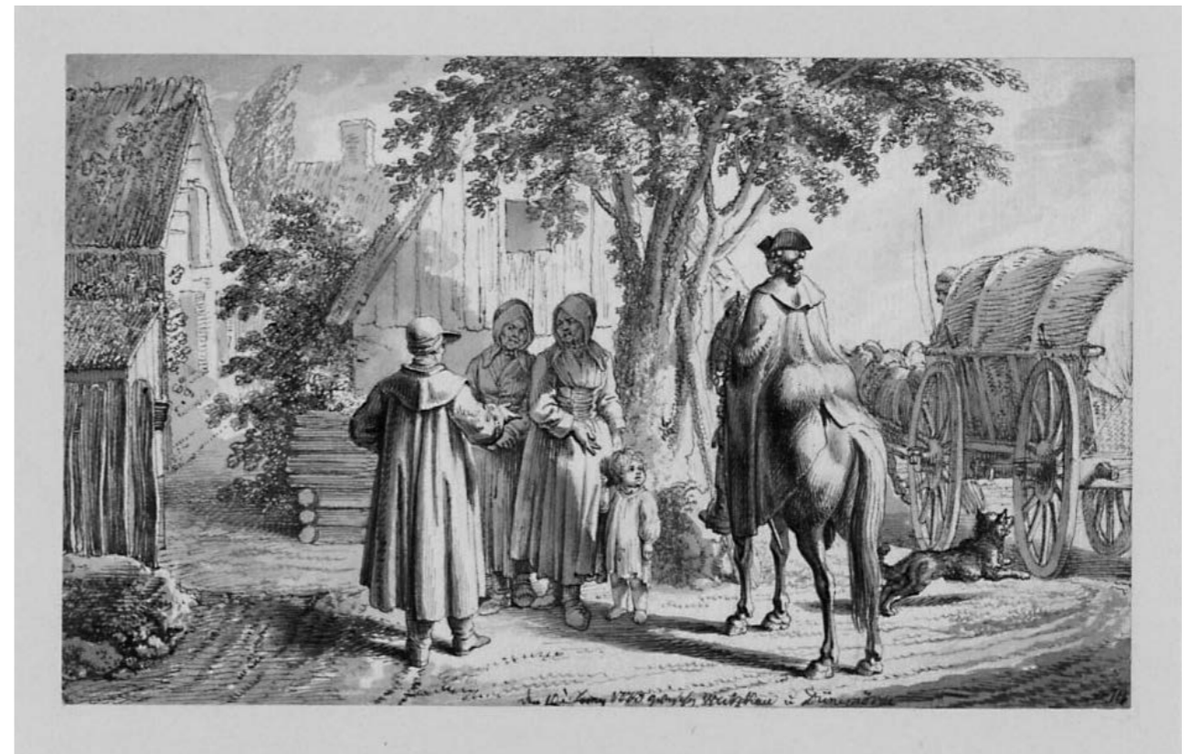
2. D. N. Chodowiecki, In a Kashubian Village (10 VI 1773), ink and wash, 11,1 × 18,4. Akademie der Künste, Berlin, Kunstsammlung, inv. no. Chodowiecki 14.

Examining the drawings, one can easily distinguish between two groups: on the one hand there are sketch-like figure studies, which might have been drawn in situ as aides memoires to document certain types of people in their typical attire. On the other, there are 50 more refined scenes, carefully executed in pen with various washes. The latter were certainly drawn after Chodowiecki's return to Berlin and over a long period of at least three years 6 . Helmut Börsch-Supan, in an attempt to reconstruct the original order of the extant drawings, has identified at least three original sketchbooks, which were later dissolved and partly trimmed in order to form a series of more uniform appearance 7 .