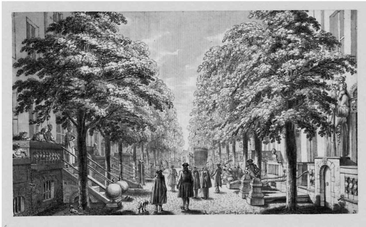
3. D. N. Chodowiecki, Długa Street in Gdańsk (11 VI 1773), ink and wash, gouache, 11,2 × 18,4. Photo: Akademie der Künste, Berlin, Kunstsammlung, inv. no. Chodowiecki 21. Photo: AdK

who is depicted. The artist seamlessly blends into the scenes. He has immersed himself in the culture of his homeland and presents himself as an integral part of the high society of Danzig. The lack of individual features and the carefully framed compositions also indicate that the series might have served a broader purpose than self-promotion. The drawings add up to a carefully constructed portrayal of a cultured society, which featured the artist at its very core.