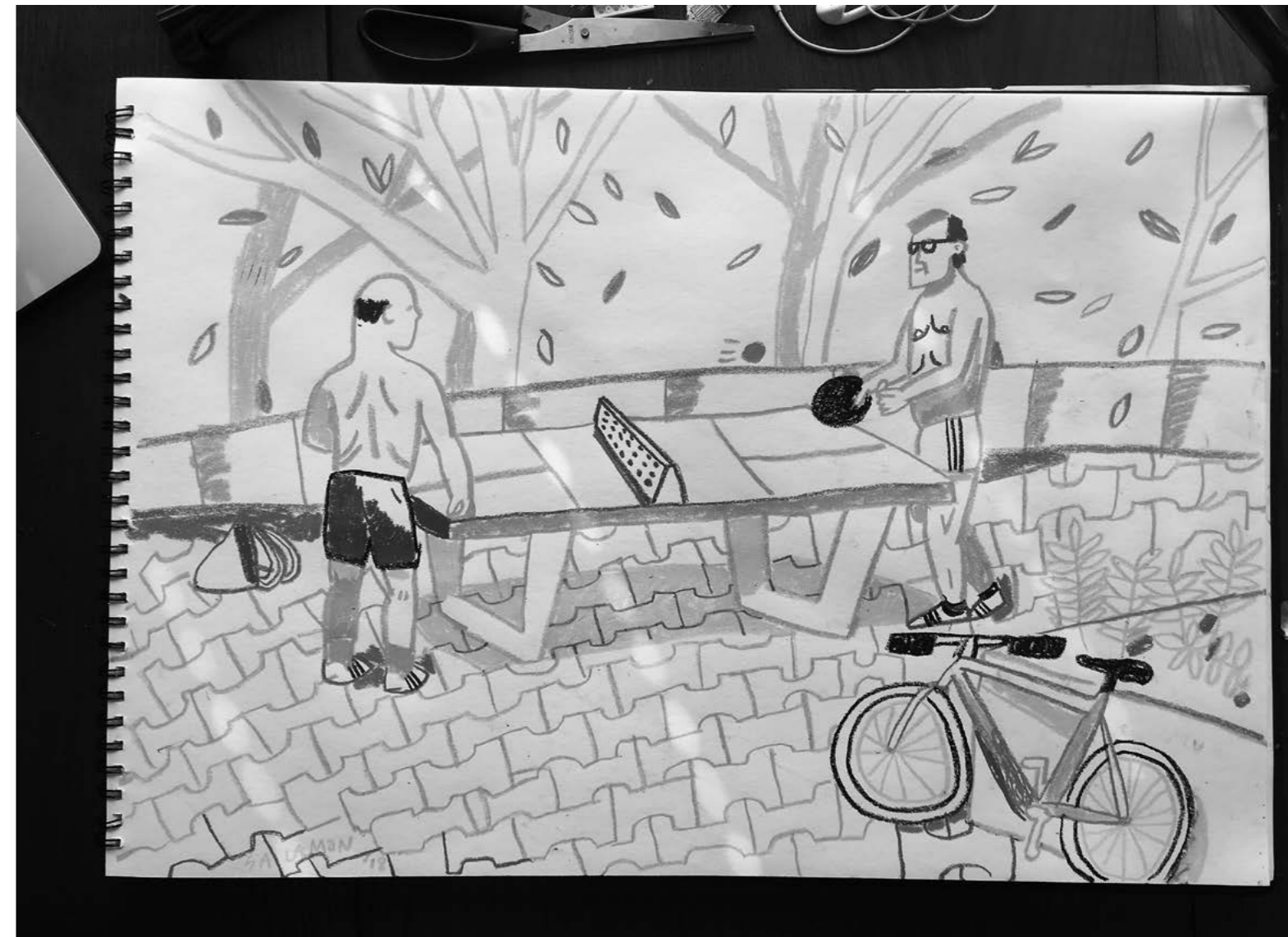
6. "From Berlin to Gdańsk", exhibition detail.

The final outcome of this trip, apart from works of art forming an interdisciplinary entity, was an exhibition arranged in the future seat of the formerly-mentioned Daniel Chodowiecki and Günter Grass