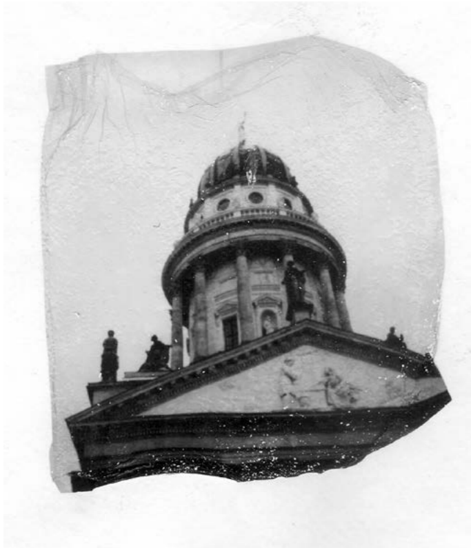
4. "From Berlin to Gdańsk", exhibition detail.

to indirectly take active part in the process of constructing local cultural identity by, firstly, reconstructing a certain set of memories, and, secondly, internalizing and interpreting the given subject connected with particular historical, geographical and cultural values, in order to build their own contemporary senses on top of it 34 .