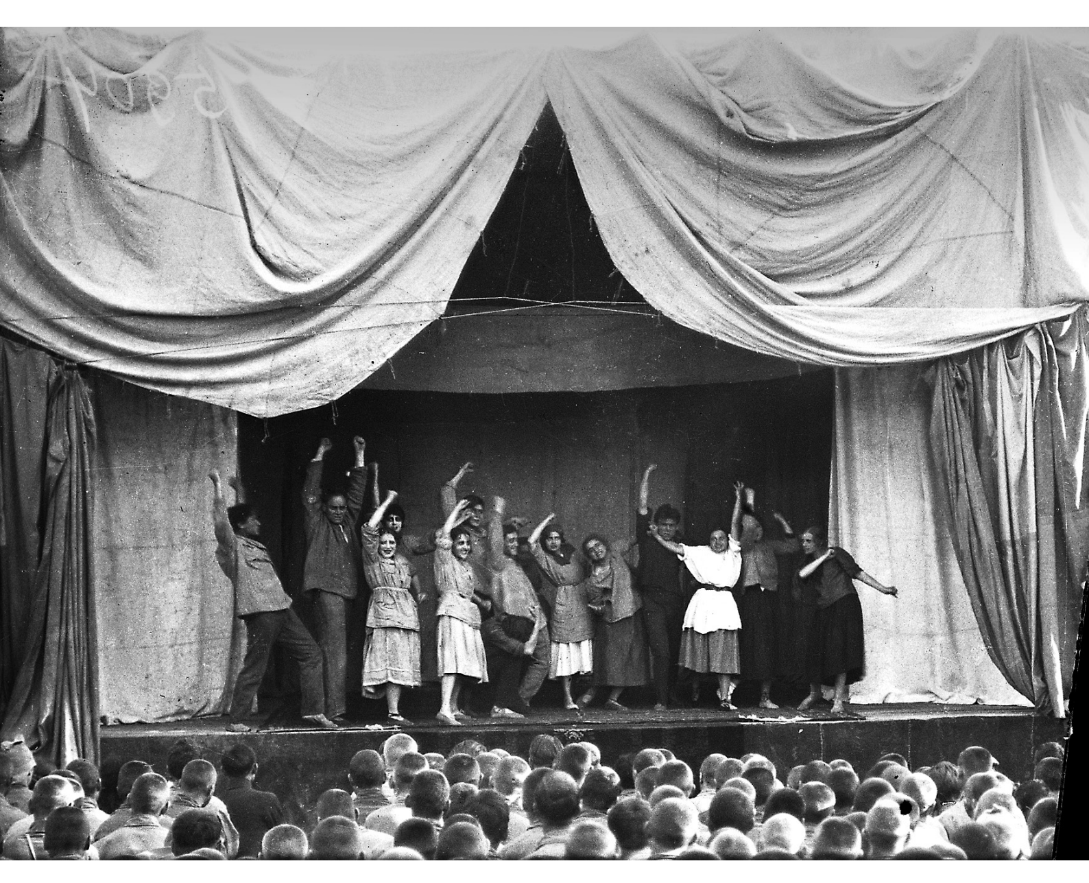
6. Scene from the show Zhovten (October), dir. Les Kurbas, set design Vadym Meller, premiere on 7 November 1922, Berezil Artistic Association.